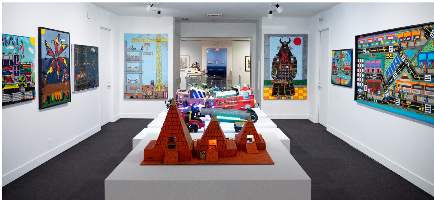
Installation view of Jaime Grant featured in The Daily Act of Art Making