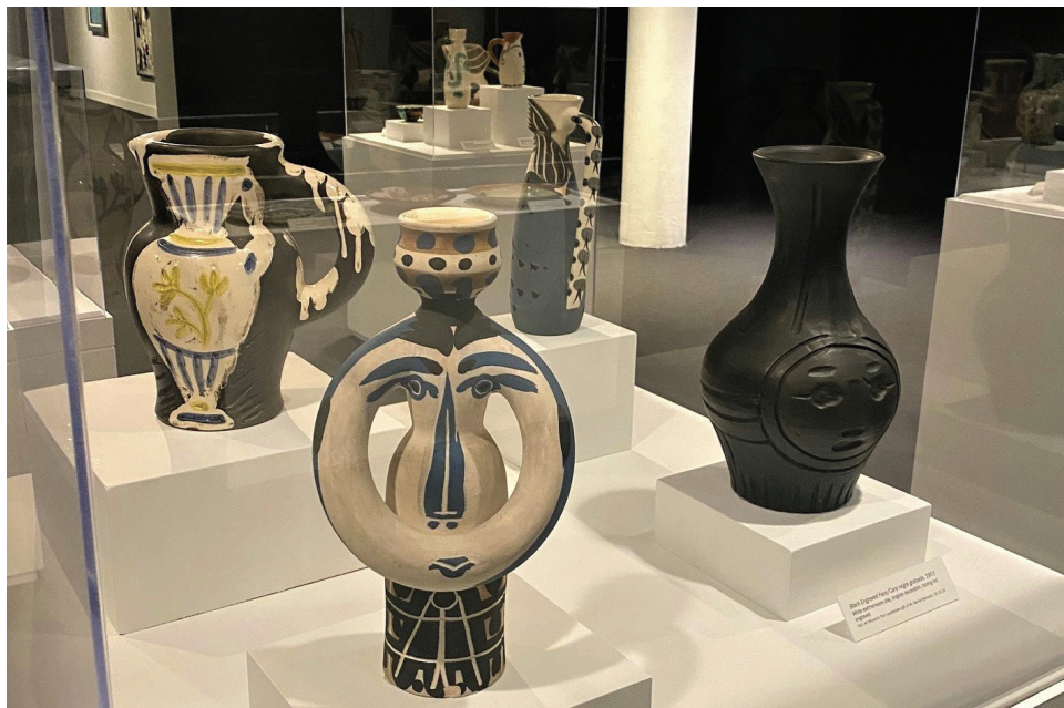
Installation view of Pablo Picasso: From Dust You Are, To Dust You Return , 2023.