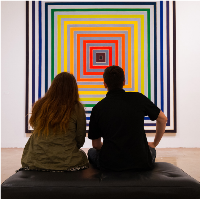
Frank Stella, Lettre sur les sourds et muets II, Diderot series , 1974. Private Collection, NY. © 2021 Frank Stella / Artists Rights Society (ARS), New York