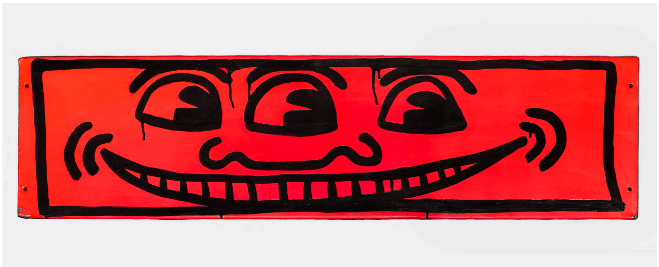
Keith Haring, Untitled (3 Eye Smiley Face) , 1982. Enamel on sheet metal. Private Collection, Florida © Keith Haring Foundation

The Happy! exhibition at NSU Art Museum includes several works by Keith Haring, who was born in Reading, Pennsylvania, in 1958 and lived and worked in New York until his death in 1990. Haring created hundreds of symbolic, graffiti-infused drawings, paintings and murals during his short lifetime. One of the pieces, Untitled (3 Eye Smiley Face) , 1982, depicts a frequently used, recognizable image from his repertoire. He reportedly developed this image by accident when he left too much room between two eyes and decided to fill the gap by adding a third. Many have offered alternative meanings to this third eye. However, Haring felt the meaning of this image as well as many of his other iconic emblems should remain open for interpretation.